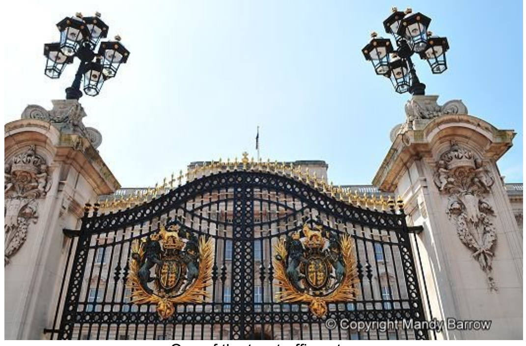
One of the two traffic gates

Buckingham Palace is the Queen's official and main royal London home. It has been the official London residence of Britain's monarchy since 1837. <u>Queen Victoria</u> was the first monarch to live there.