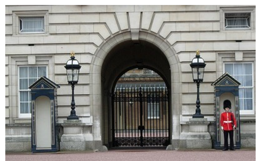
Standing guard outside Buckingham Palace